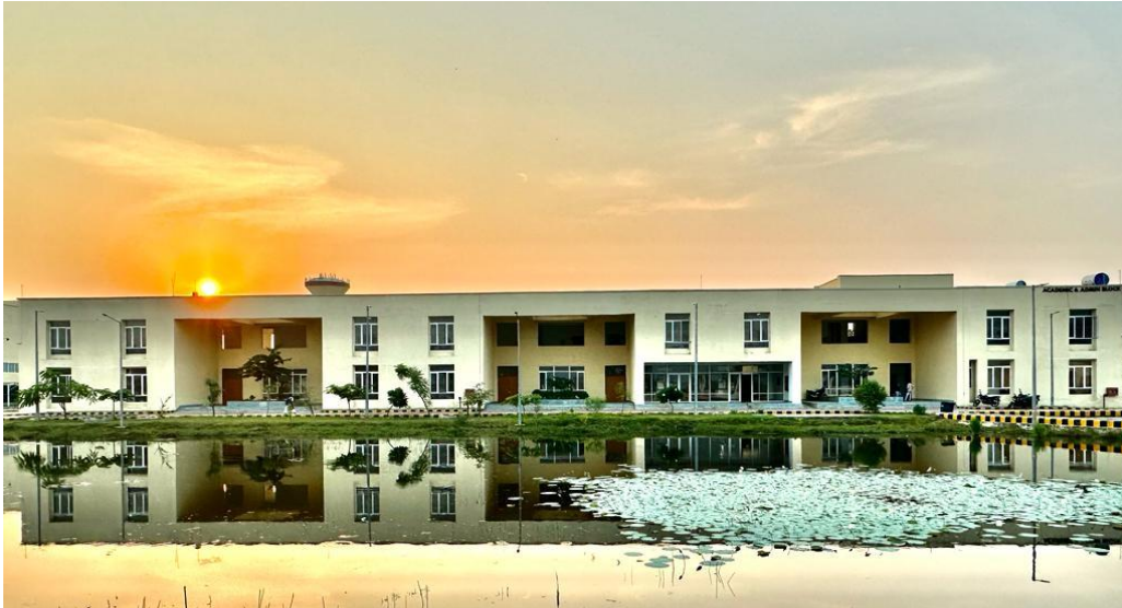
Admin & Academic Block