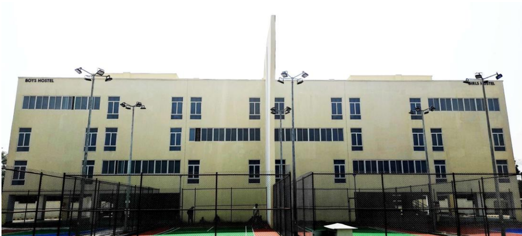
Boys & Girls Hostel